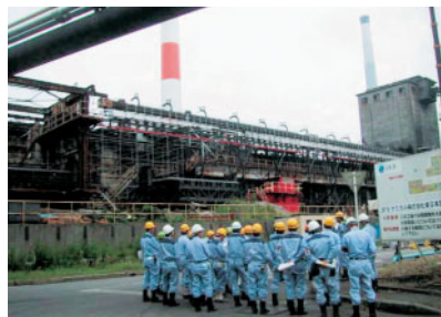
Works Environmental Patrols