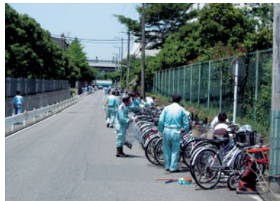
Public Road Cleanup Operations