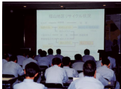
Lectures on the environment