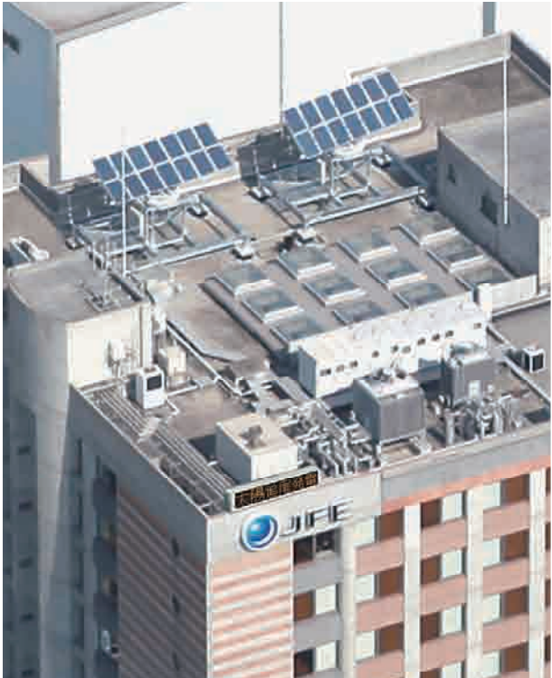
Solar tracking power generation system installed in Yokohama Head Office Building

More specifically, we are improving our sales capabilities by revamping marketing and sales strategies for each product, and will create and introduce new products based on research covering the environmental policies and advanced technology trends in various countries. In addition, aiming to double the size of our overseas business as rapidly as practicable, we will establish offices or other facilities in China, Southeast Asia, India, Europe, and other areas where there are expectations for solid demand. We will also examine all possibilities for alliances as we work to maximize profits in each of our business areas.