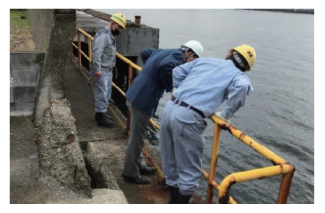
On-site audit at a domestic Group company