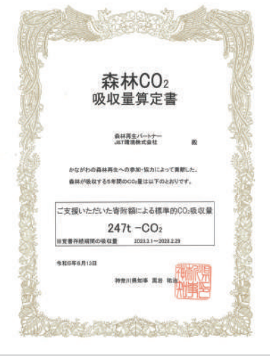
Valuation report on CO_2 absorption by the forest

*For details about the Reforestation Partner Program, please refer to: