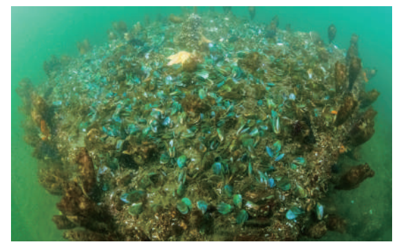
Marine Block<sup>™</sup> covered by marine bivalves (Yokohama Bay area)