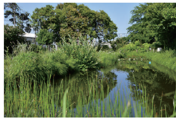
Dragonfly Pond serving as biotope

Furthermore, JFE Engineering has been a co-sponsor of the How Far Do Dragonflies Fly since FY2020, with the aim of improving the quality of green spaces in the Keihin coastal areas and contributing to biodiversity. The forum brings together companies, residents, governments, and experts and conducts research activities such as capturing dragonflies that fly in 15 green spaces and biotopes scattered throughout the Keihin Coastal Area and inland areas, tagging them, releasing them, and tracking their movements. The JFE Dragonfly Path also serves as one of the research sites. This forum celebrated its 20th anniversary in 2022, and JFE participated in a panel discussion at the commemorative event at Yokohama City Hall and exchanged opinions with other companies.