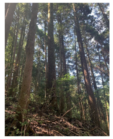
J&T Kankyo Miracle Forest