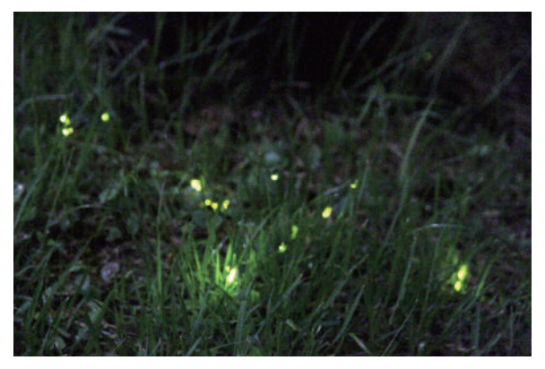
Firefly viewing party