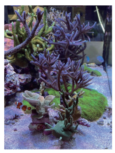
Healthy coral growth on Marine Block<sup>™</sup> inside the water tank

*A venture company engaged in the development of systems for managing and nurturing corals and fish by combining its aquarist know-how with IoT and AI.