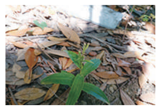
A Kugenuma orchid discovered at the planned construction site for the JFE Ohgishima Thermal Power Plant

Plant No. 1 in the JFE Ohgishima Thermal Power Plant, an aging facility, was renovated and resumed operations in 2019. Before this construction, we conducted an environmental prediction and evaluation for the renovation, in accordance with the Environmental Impact Assessment Act and Electricity Business Act. As a result, the Kugenuma orchid, a plant listed in Japan's Ministry of Environment's fourth version of the Red List as an endangered species (Threatened II- Vulnerable, VU), was discovered at the planned construction site for power generation facilities. To preserve the orchids, we replanted them in a different location of the site that had a similar environment.