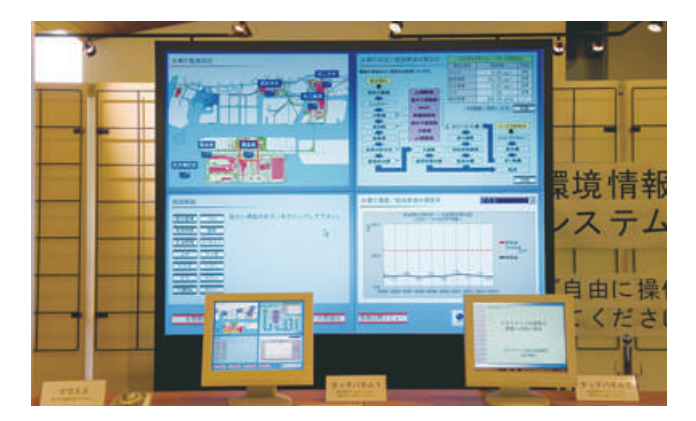
Environmental data display in the Keihin District

The East Japan Works of JFE Steel discloses real time environmental data on local air and water quality. Visitors can review this information in the first-floor lobby of the Visitor Center in the Chiba District and in the Amenity Hall and the first-floor lobby of the Keihin Building in the Keihin District.