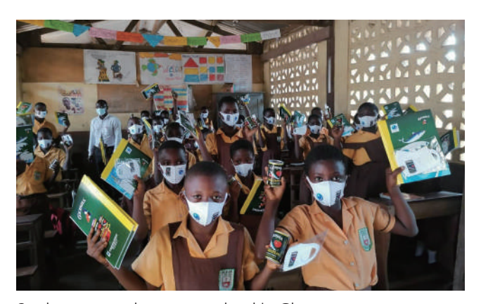
Students at an elementary school in Ghana

The JFE Shoji Group will continue to provide support for food and education into the future, as a project that symbolizes the Group's commitment.