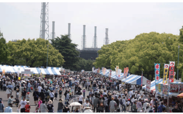
JFE West Japan Festival in Fukuyama

In addition, on-site recreational facilities are made available for community sports such as soccer, baseball, volleyball and basketball as well as other events sponsored by Group companies. Coaching sessions are offered by company baseball and track teams, which compete in Japan's top-level corporate leagues. Such activities promote sports and health as well as stronger relationships with host communities.