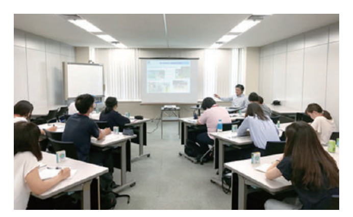
Business training for schoolteachers

As part of career education for high school and junior high school students, Kawasho Foods Corporation, a member of the JFE Shoji group, cooperates with the School Support Center, a specified Nonprofit Corporation, to invite students for training. The participants learn how society is supported by specific kinds of work as well as the products and services related to such work.