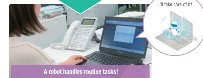
A robot handles routine tasks!