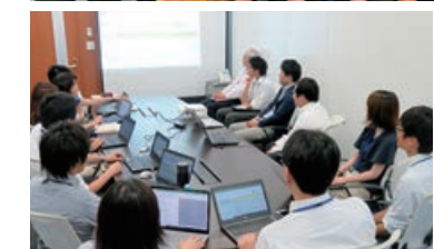
Top: RPA Promotion Team Bottom: Team meeting