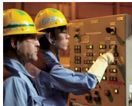
Cultivating human resources

The JFE Group actively hires new recruits and maintains healthy labor-management relations in its commitment to provide a dynamic working environment for a diverse workforce. The Group is an equal opportunity employer for persons with physical disabilities and encourages respect for human rights. Occupational safety and the maintenance of favorable work environments for employees are top priorities.