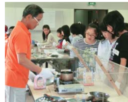
Manufacturing workshop for children

The JFE Group supports the communities where it operates with a variety of long-term initiatives, such as support for university research and educational events, cultural and social welfare activities and disaster-related reconstruction.