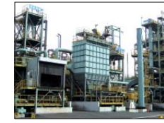
Ferro-coke production facility

JFE's steel business utilizes world-leading energy-efficient manufacturing processes enabled by the active introduction of energy-saving facilities. Going forward, the company will continue to reduce its resource and energy consumption and lower the environmental impact of its operations by developing advanced new eco-friendly technologies.