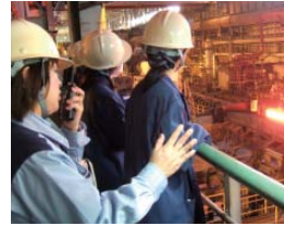
Plant tour for JFE Group shareholders

The JFE Group places high priority on the timely and appropriate disclosure of corporate information, making every effort to release information online and publish business results promptly. Plant tours and investor briefings are conducted to enhance stakeholders' understanding of the Group's business and activities.