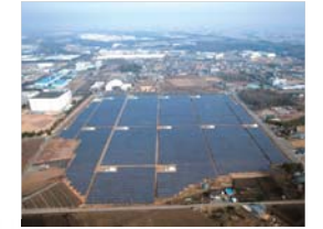
Photovoltaic power generation facility

In supplying highly functional steel materials that are indispensable to economic development, JFE also pursues resource recycling and renewable energy-related initiatives to help realize increasingly low-carbon societies through eco-friendly products and services.