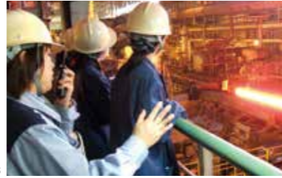
Plant tours for shareholders

JFE places a high priority on the timely and appropriate disclosure of corporate information, including by harnessing the instantaneous nature of its website and announcing financial results promptly. Plant tours and investor briefings are organized to deepen society's understanding of JFE activities.