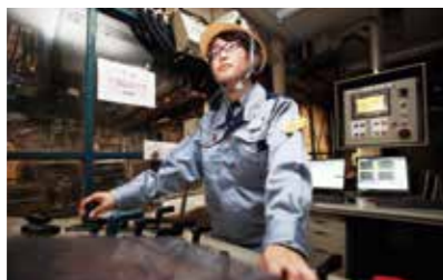
Female employees are actively involved in manufacturing

JFE actively hires new recruits and nurtures healthy labor-management relations. It maintains safe work environments, is an equal-opportunity employer for people with physical disabilities and encourages respect for human rights. JFE underlines these policies with a commitment to providing dynamic working environments for its increasingly diverse workforce.