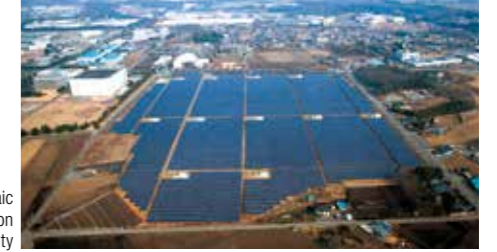
Photovoltaic power generation facility

JFE products and services are helping to realize eco-societies. Specific efforts include JEF's supply of highly functional steel materials needed in low-carbon societies, recycling programs throughout the Group, and diverse initiatives for renewable energy use.