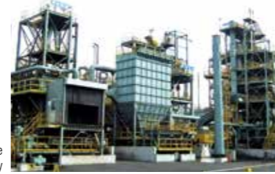
Ferro-coke production facility

Our steel manufacturing processes boast world-class energy efficiency thanks to our energy-saving facilities and technologies. Going forward, we will continue to reduce our consumption of resources and energy, as well as lower the environmental impact of our operations.