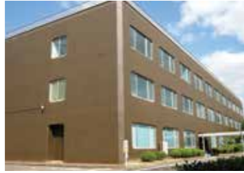
Customer Center Fukuyama

JFE delivers top-quality products and services that enable customers to strengthen the competitiveness of their businesses. To satisfy customer needs, the Group acquires diverse certifications, deploys wide-ranging quality-management systems and operates product-development facilities where JFE and customers work together.