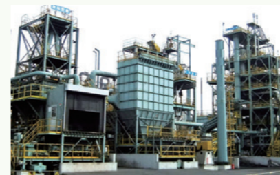
Ferro-coke production facility

JFE offers innovative, world-class technologies and environmentally sound products and services produced with reduced-load processes. In turn, these offerings help to protect the environment by enabling reduced greenhouse gas emissions, resource recycling and biodiversity protection.