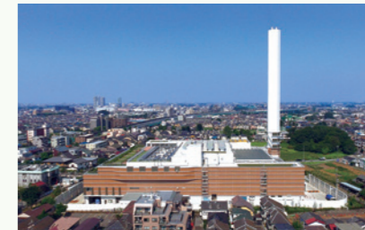
Nerima Incineration Plant (Municipal waste-to-energy plant)

Technologies from JFE are incorporated in roads, waste-treatment facilities and other infrastructure that support daily life and lower environmental impacts.