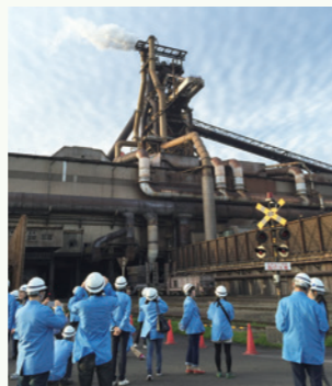
Plant tours for shareholders

JFE places a high priority on the timely and appropriate disclosure of corporate information, including through immediate messaging via its website and prompt announcements of financial results. Plant tours and investor briefings are organized to deepen understanding of JFE activities.