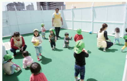
Company childcare facility

To create a corporate environment in which diverse human resources can work with vitality, JFE promotes work-life balance, support for balanced lifestyles, safe and rewarding workplaces, the enhancement of individual abilities, the transfer of skills and healthy employer-employee relations.