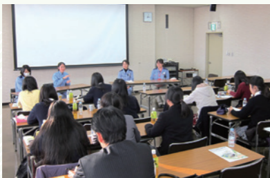
Hosting high school students for career education

JFE hosts events at its manufacturing facilities and provides education to contribute to local communities. The company also is actively engaged in social-contribution activities, including providing university research grants and youth-development support in Japan and abroad.