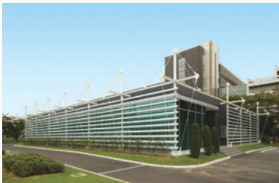
Customers Solution Lab (CSL)

JFE delivers top-quality products and services that enable customers to strengthen the competitiveness of their businesses. To satisfy customer needs, the Group acquires diverse certifications, deploys wide-ranging quality-management systems and operates product-development facilities where JFE and customers work together.