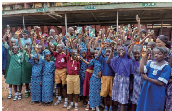
Students at an elementary school in Nigeria