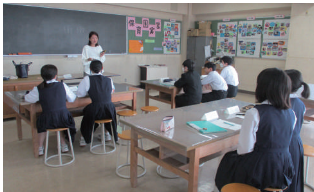
Kawasaki Middle School in Kawasaki City, Kanagawa Prefecture

JFE Steel conducts plant tours for students at nearby elementary and junior high schools. In addition, company employees visit schools to give lectures on iron and steelmaking processes, the features of steelworks, environmental initiatives, and other topics to deepen understanding of the steel industry and career opportunities. In FY2023, these lectures have been given to 400 students in 16 classes, bringing the total to approximately 325 classes since these began in FY2012.