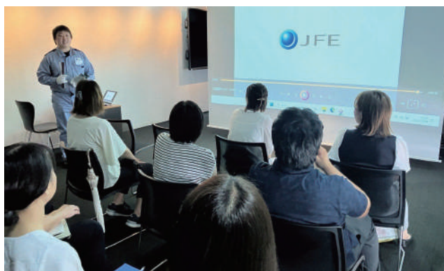
Business training for schoolteachers

As part of career education for high school and junior high school students, Kawasho Foods Corporation, a member of the JFE Shoji group, cooperates with the School Support Center, a specified Nonprofit Corporation, to invite students for training. The participants learn how society is supported by specific kinds of work as well as the products and services related to such work.