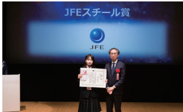
JFE Steel Award presented to a student from Ibaraki Prefectural Namiki Secondary School

The Japan Science & Engineering Challenge is a national science-paper contest for high school and technical college students. Under the sponsorship of the Asahi Shimbun Company and TV Asahi Corporation, the contest has been supported by JFE Steel since 2006 to nurture future scientists and engineers.