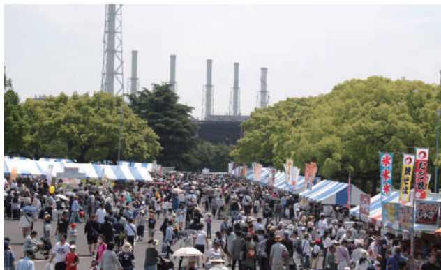
JFE West Japan Festival in Fukuyama

In addition, on-site recreational facilities are made available for community sports such as soccer, baseball, volleyball and basketball as well as other events sponsored by Group companies. Coaching sessions are offered by company baseball and track teams, which compete in Japan's top-level corporate leagues. Such activities promote sports and health as well as stronger relationships with host communities.