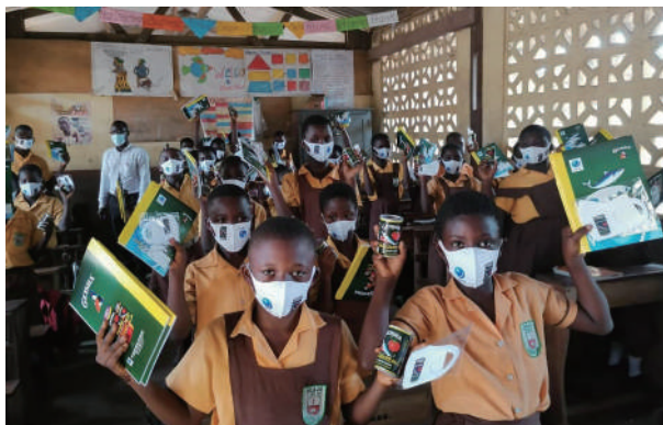
Students at an elementary school in Ghana