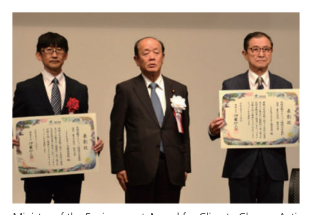
Minister of the Environment Award for Climate Change Action

External ESG Evaluations | External Awards | Third-Party Comments |