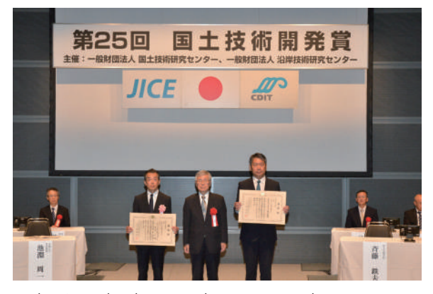
25th JICE Technology Development Award