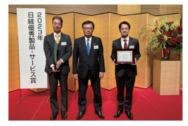
Nikkei Superior Products and Services Awards