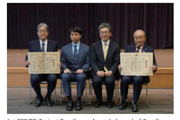
1st PPP/PFI Project Excellence Award, Award of Excellence