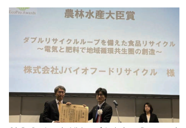
6th EcoPro Awards, Minister of Agriculture, Forestry and Fisheries Award